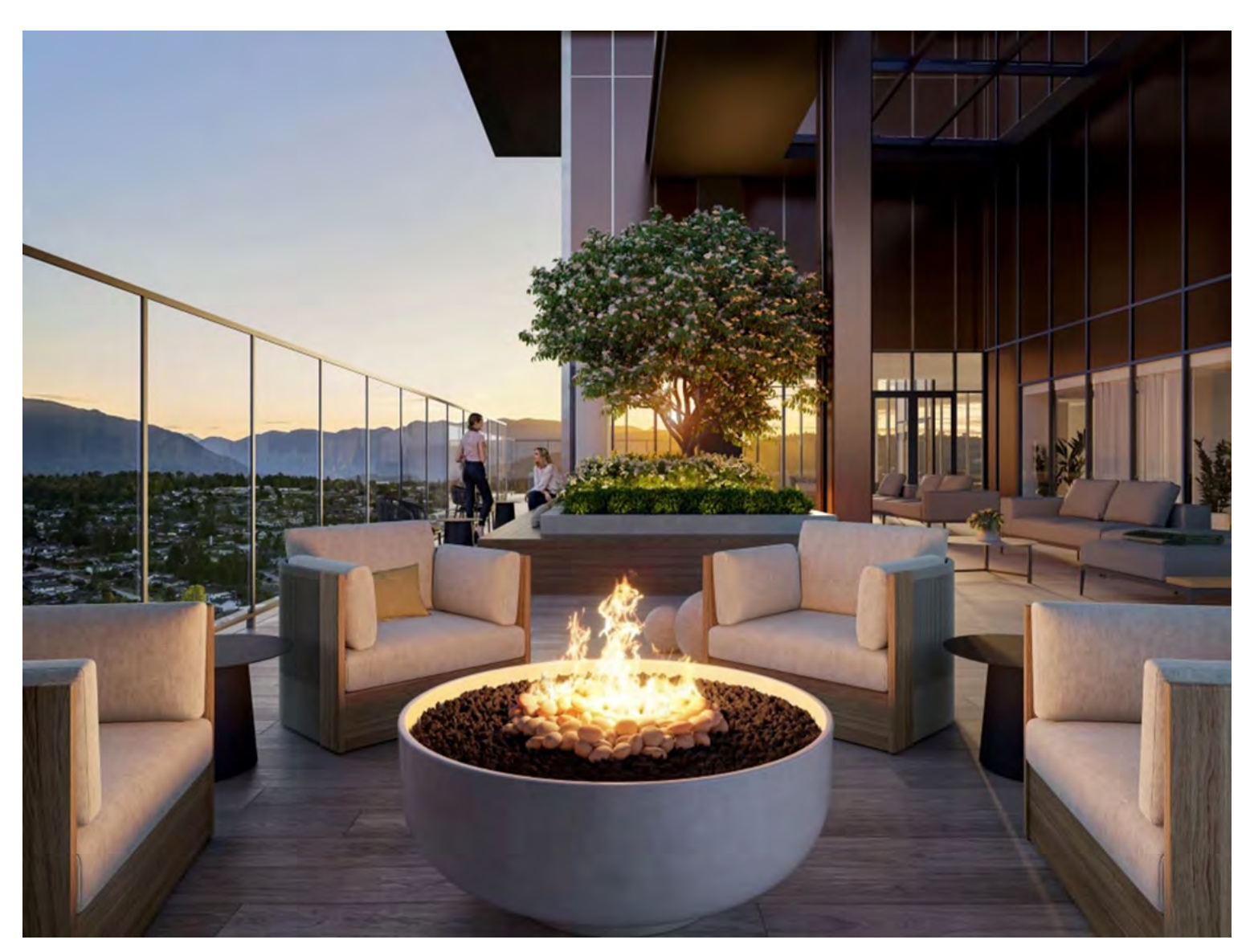
A 3,800-square-foot terrace atop the 43-storey first tower in the Bassano community offers panoramic views and three separate patios. SUPPLIED/ARTIST'S RENDERING

Published Sep 23, 2024 · Last updated Sep 23, 2024 · 3 minute read