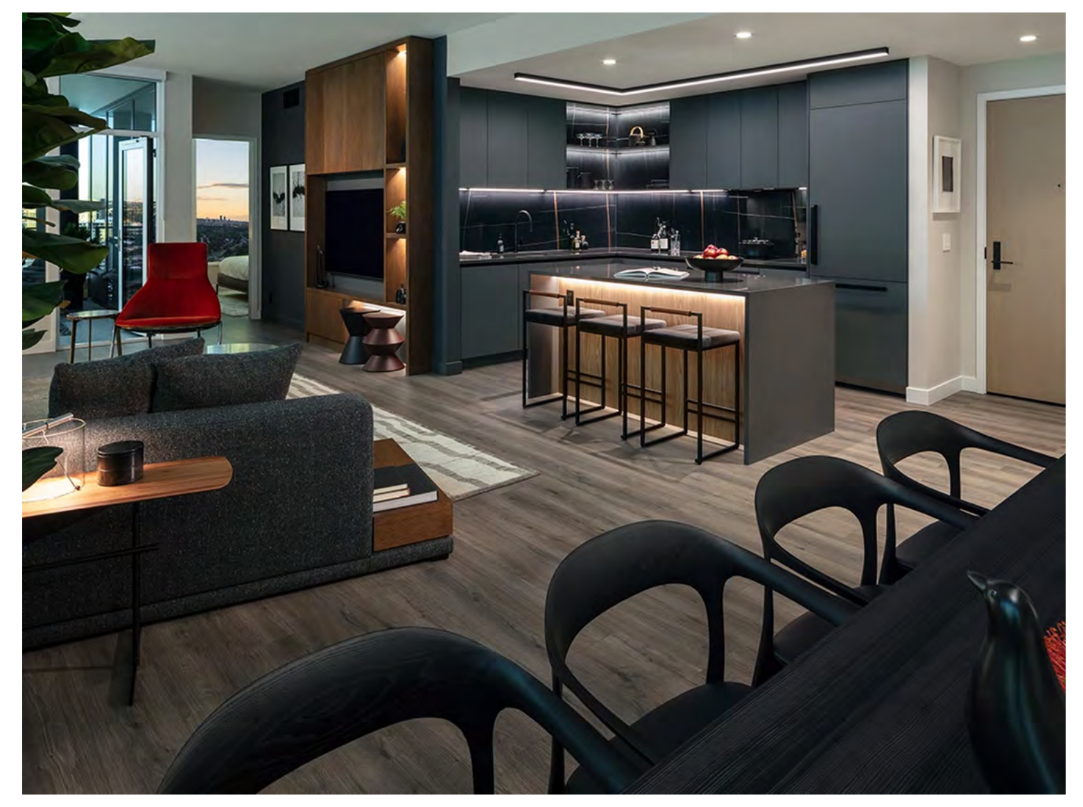
The homes in Bassano boast custom cabinetry, large-format backsplash slabs, integrated Bertazzoni appliances and Gessi faucets, among other details.

The Market Café will be a place to grab a coffee or a bite and to buy groceries and essentials to enjoy at home.