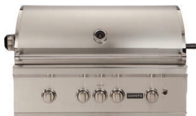
S-SERIES: Model No. CS(L)36LP & CS(L)36NG 36" COYOTE S-SERIES GRILL WITH/WITHOUT LED LIGHTS