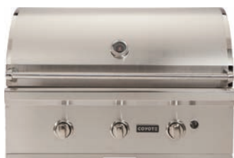
C-SERIES: Model No. CC3LP & CC3NG 34" COYOTE C-SERIES GRILL HEAD