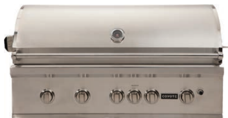
S-SERIES: Model No. CSL42LP & CSL42NG 42" COYOTE S-SERIES GRILL WITH LED LIGHTS