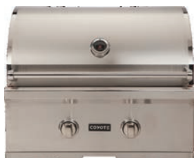
C-SERIES: Model No. CCX2LP & CCX2NG 28" COYOTE C-SERIES GRILL HEAD