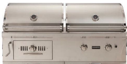
H-SERIES: Model No. CH50LP & CH50NG 50" COYOTE CENTAUR™ GAS AND CHARCOAL GRILL